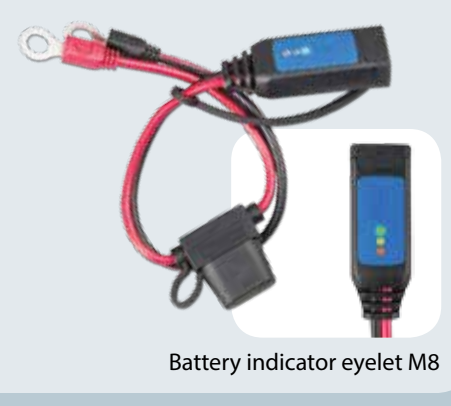
Battery indicator eyelet M8