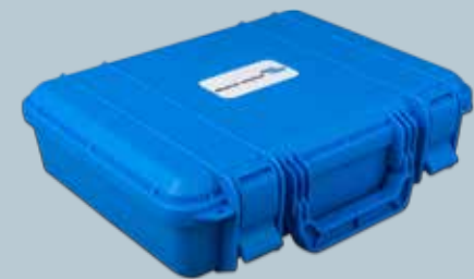
Carry Case for Blue Smart IP65 Chargers and accessories