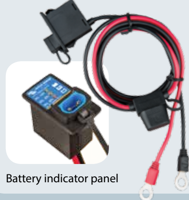
Battery indicator panel