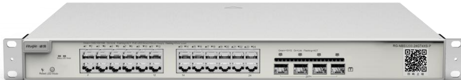
Fig 4 RG-NBS3200-24GT4XS-P