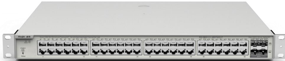
Fig 5 RG-NBS3200-48GT4XS-P