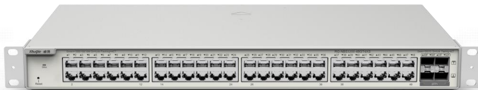
Fig 2 RG-NBS3200-48GT4XS / RG-NBS3200-48GT4XS-P