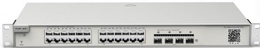
Fig 1 RG-NBS3200-24GT4XS