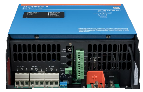
Connection Area MultiPlus-II 3k