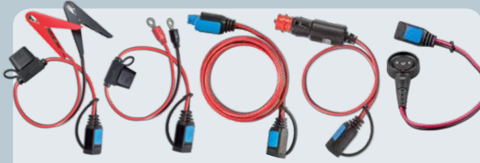
Fused clamps Fused M6 or M8 eyelets Extension cable 2m Autoplug MagCode Power Clip 12V