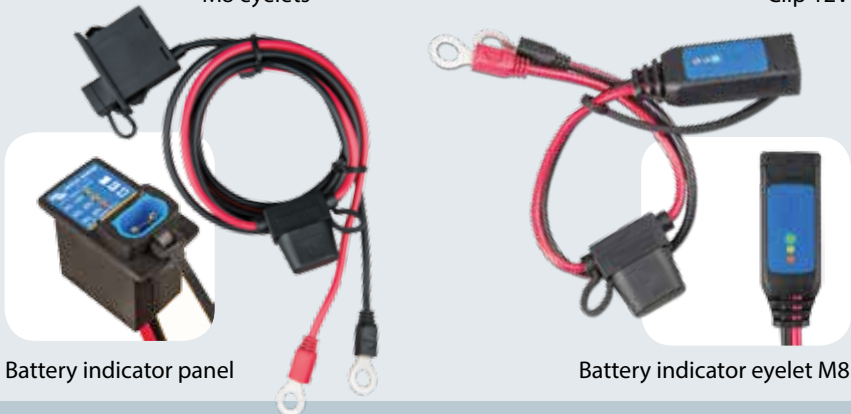
Battery indicator panel Battery indicator eyelet M8